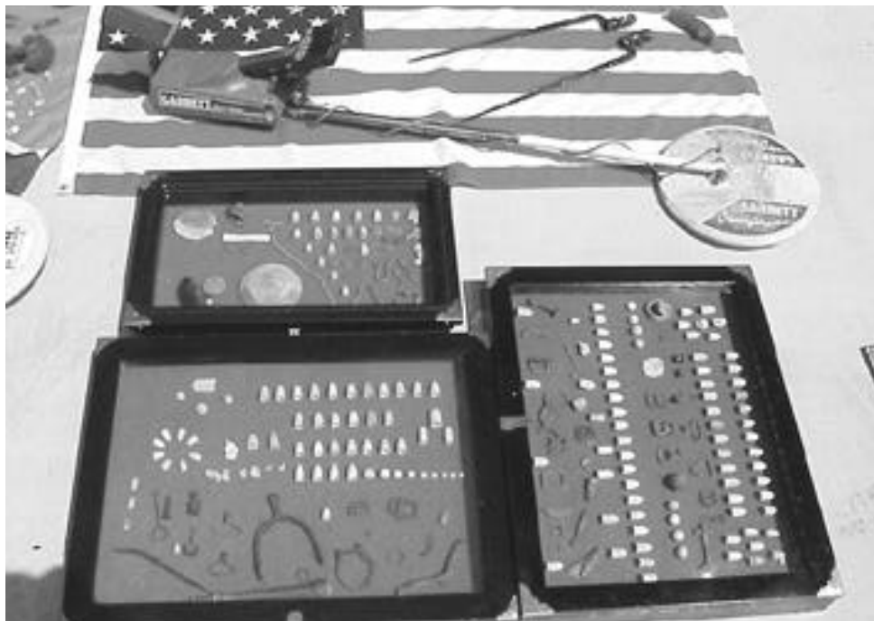
Treasure found at Marks Miles battlefield.

I went with shovel in hand and sure enough, out came an unfired, .577 caliber Confederate Enfield bullet. This is great, I thought as I swept the hole again and lo and behold another signal. Yep, sure enough, another "drop". I did this five more times and pulled a total of 7 of these confederate slugs. I thought, thank you Lord, I can't do better than this on such a short trip and contentedly walked back to the truck, but only after circling this hole about 10 feet out around it in case this soldier dropped anything else. I know exactly how to get back to the spot and I believe that there's more to be found. Perhaps one Saturday soon I'll be out there